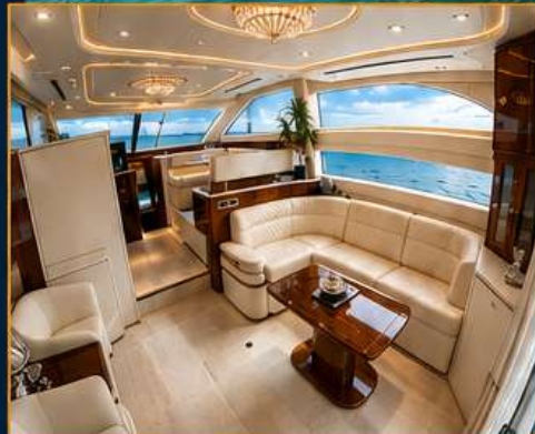
LUXURY LIVING ROOM