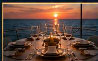
SUNSET DINNER EXPERIENCE