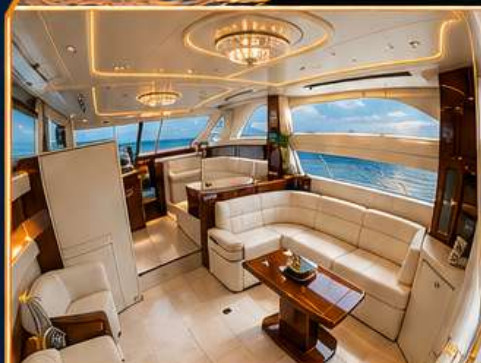
LUXURY LIVING ROOM