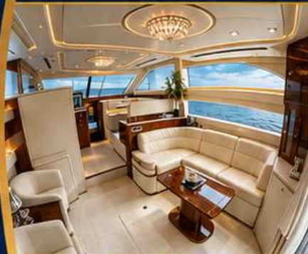
LUXURY LIVING ROOM