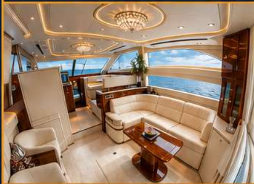
LUXURY LIVING ROOM