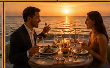
PRIVATE DINING EXPERIENCE