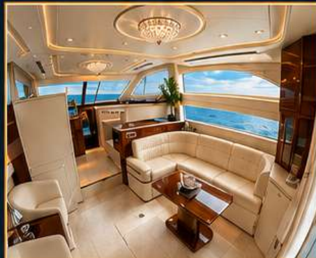
LUXURY LIVING ROOM