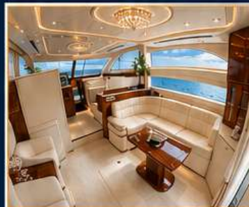
LUXURY LIVING ROOM