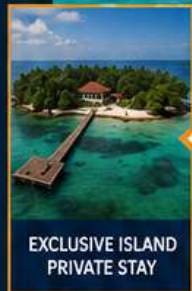
EXCLUSIVE ISLAND PRIVATE STAY