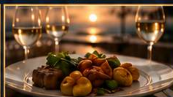
FINE DINING ONBOARD