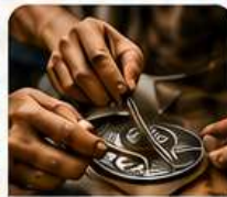
CELUK VILLAGE SILVER CRAFT