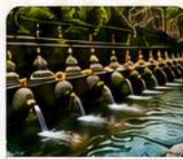
TIRTA EMPUL TEMPLE HOLY WATER TEMPLE