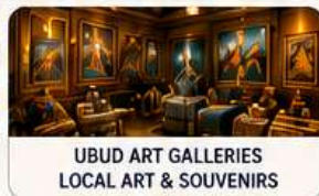
UBUD ART GALLERIES LOCAL ART & SOUVENIRS