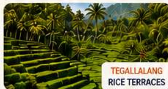
TEGALLALANG RICE TERRACES