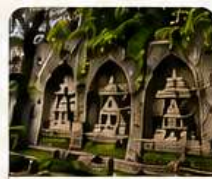
GUNUNG KAWI ROYAL MONUMENT