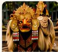
BARONG DANCE BATUBULAN