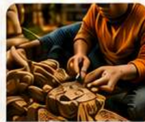
MAS VILLAGE WOOD CARVING