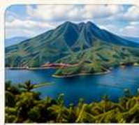
KINTAMANI BATUR VOLCANO