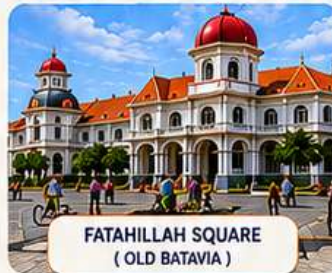
FATAHILLAH SQUARE (OLD BATAVIA)