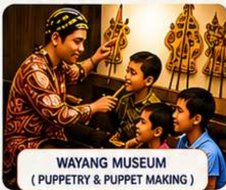
WAYANG MUSEUM (PUPPETRY & PUPPET MAKING)