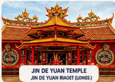
JIN DE YUAN TEMPLE JIN DE YUAN RIAOET (LONGS)