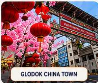
GLODOK CHINA TOWN