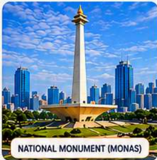
NATIONAL MONUMENT (MONAS)