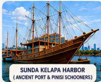
SUNDA KELAPA HARBOR (ANCIENT PORT & PINISI SCHOONERS)