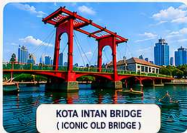
KOTA INTAN BRIDGE (ICONIC OLD BRIDGE)