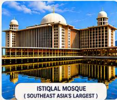
ISTIQLAL MOSQUE (SOUTHEAST ASIA'S LARGEST)